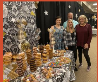
DMIG Crew setting up VTR Prom